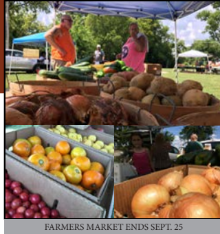
FARMERS MARKET ENDS SEPT. 25