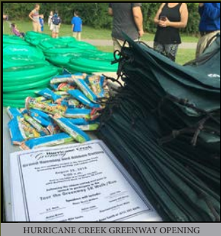
HURRICANE CREEK GREENWAY OPENING