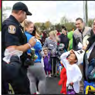
GOBLINS AND GOODIES AT THE PARK