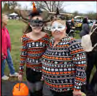
GOBLINS AND GOODIES AT THE PARK